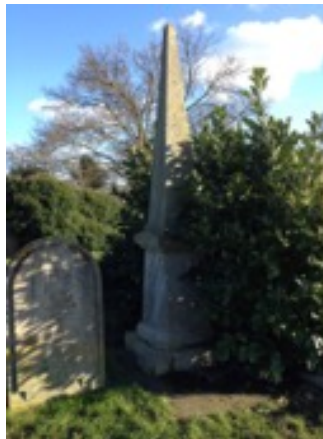
18 Mary the Great behind the yew trees Ivy on cross & column & low growing plant 19