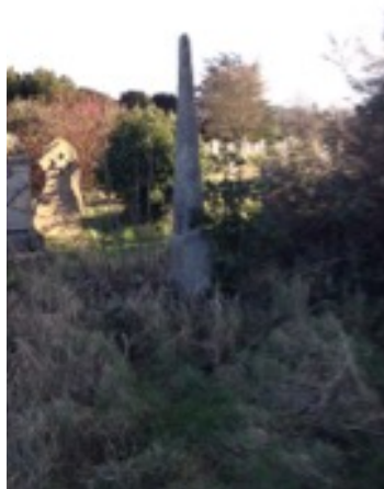
10 Holly Tree growing close to column All Saints