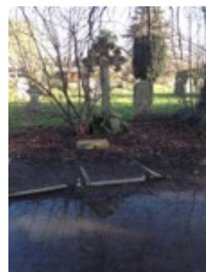
Foliage cross Central Path endangered by self set tree