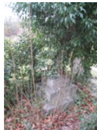
11 Matthew family cross being pushed over towards path.