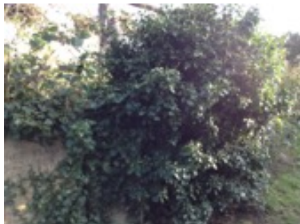
9 Ivy - Beales & Watts (fallen column)