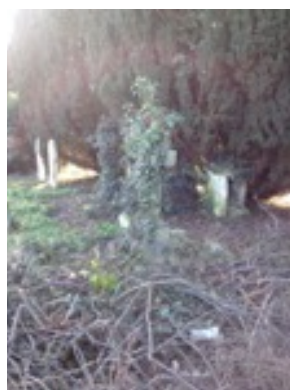
20 Brambles & ivy growing over into grave Holy Trinity